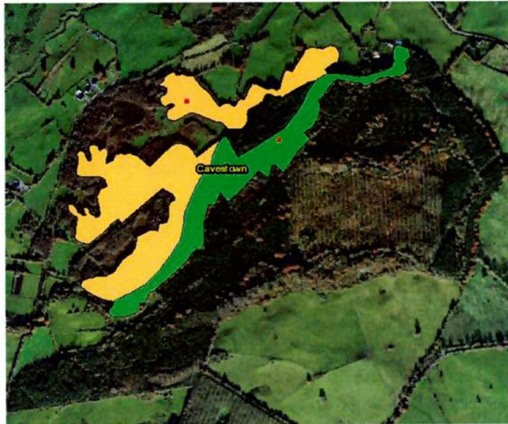
ArcGIS National Survey of Native Woodlands 2003-2008 2

We attach a screenshot of the native woodland stretch of the Cavestown woods for reference: