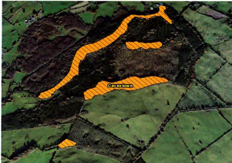
ArcGIS Ancient and Long Established Woodland Inventory 2010 4